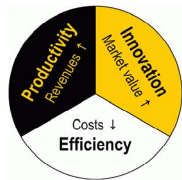
We deliver business PIE SM